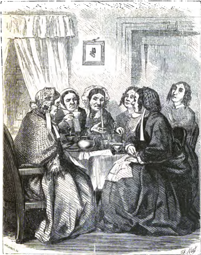
The Investigating Committee. p. 337.